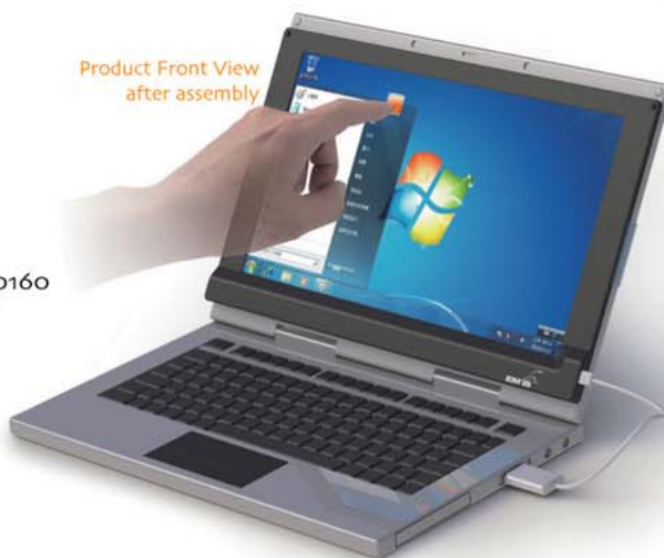
Product Front View after assembly