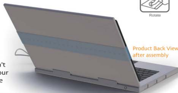
Product Back View after assembly