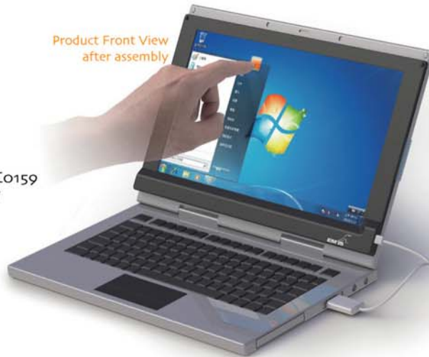
Product Front View after assembly